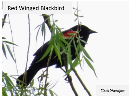
Red Winged Blackbird